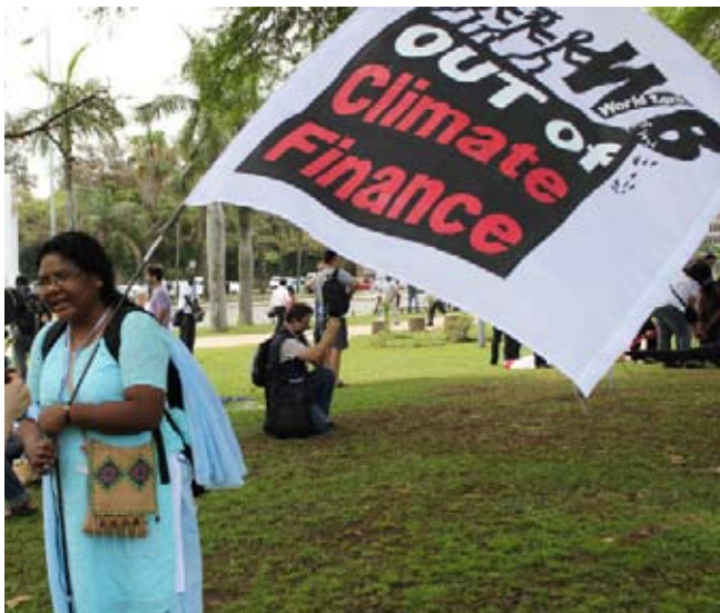
A 'World Bank out of Climate Finance' campaigner in Durban

The Green Climate Fund was also agreed. WDM, along with many other organisations from the Climate Justice Now network have long campaigned for this fund as an alternative to the World Bank. But the inclusion of a 'private sector facility' led the fund to be renamed a Greedy Corporate Fund during the talks. A pet project for the UK government, this addition enables multinational corporations and financiers to directly access tax funds to back up risky projects, instead of ensuring funds are delivered to the world's poorest people. There are still some elements of the fund that are yet to be designed, and there are certainly spaces where pressure from WDM may make a difference. We'll be speaking with our allies about this and will keep you posted if we think there are things we can do to help influence the fund for the better.