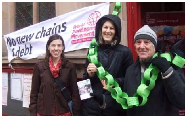
Shrewsbury WDM's collect messages for their climate 'chain of debt'