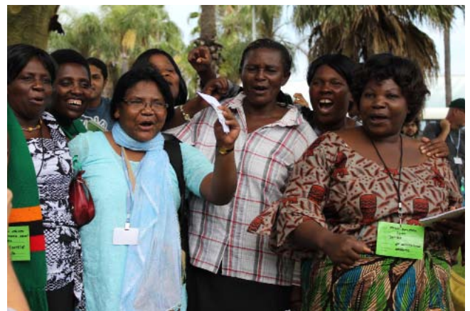
Campaigners at the UN climate talks in Durban

The talks announced a 'Durban Platform'. Essentially this is an agreement to set up a new round of talks towards an agreement which would come into force until 2020. In essence, this is much the same as the outcome painstakingly laid out at the Bali talks four years ago, the Bali Roadmap, a roadmap where rich countries lost their way and shamelessly failed to follow what they had agreed. In the past four years, following a global financial crisis, rich countries have become much less prepared to do what was necessary to tackle climate change or provide the necessary funds. In short, the Durban Platform spells out this decade, perhaps the most critical for stopping runaway climate change, as the decade of inaction on emissions cuts.