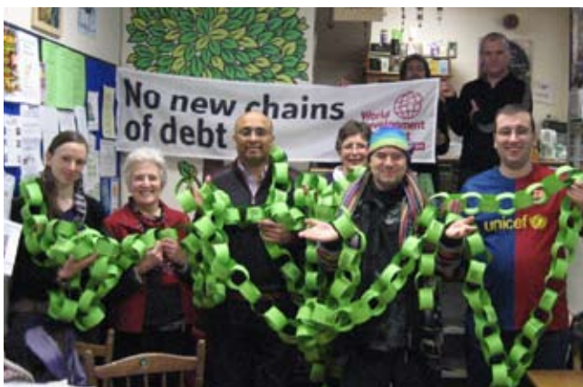
Central Lancashire WDM and their climate 'chain of debt'

A reminder to send us your completed survey and annual group subscriptions by 28 February. We know that filling in the surveys takes up considerable time in your group meetings but it really does help us to provide the best possible