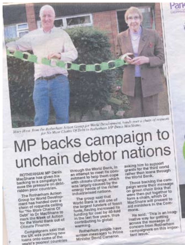
Press coverage of Rotherham WDM's climate debt action

Reading WDM is also looking like it has a new lease of life which is great. An action planning meeting took place on 24 January – watch this space!