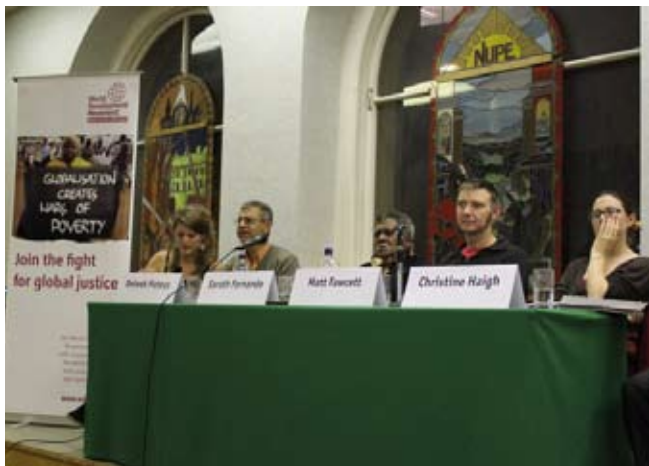
WDM's food sovereignty event in Manchester with speakers from Brazil and Sri Lanka

The end of November and early December sees various actions and events taking place linked to the climate talks in Durban (more detail in the climate justice section).