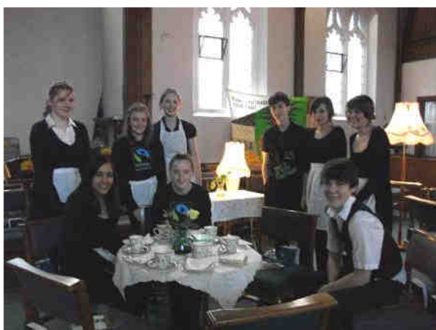
Coventry Fairtrade tea party

On Saturday 27 February Coventry WDM joined forces with the local church to host a Fairtrade Tea Party. Cakes were baked by members of the local Women's Institute, Allesley Country Market Group as well as by friends...and as many of the ingredients as possible were Fairtrade. Even the roses on each table were fairly traded! A quiz and a short talk urging people to swap to fairtrade tea, ensured that everyone who came, went away reminded about the need for trade justice.