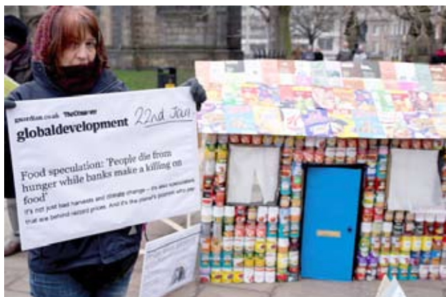
Sheffield WDM hold a food stunt with house built out of food packaging

Oxford WDM held a stall at the Witney Fair Trade market, and succeeded in getting a large number of action cards signed. The group have also recently met with their MP, Nicola Blackwood.