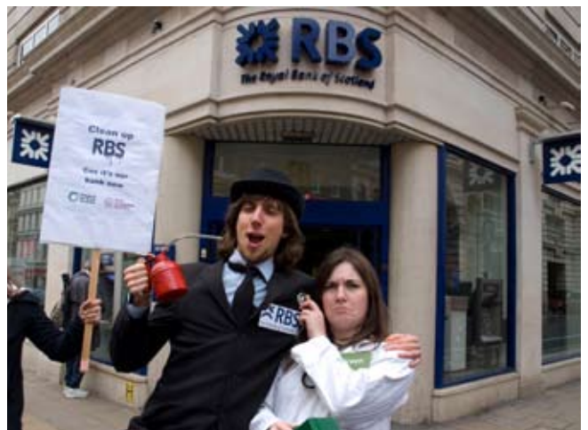
WDM activists hold a stunt outside an RBS in London

People's AGM – 18 April: despite the public rescue of RBS with more than £45Bn and an 83% government stake in the bank, taxpayers have no say in how this majority publicly-owned institution is run. More details very soon.