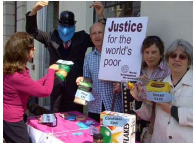
Bexhill & Hastings WDM with their overpriced food stall and Barclays eagle