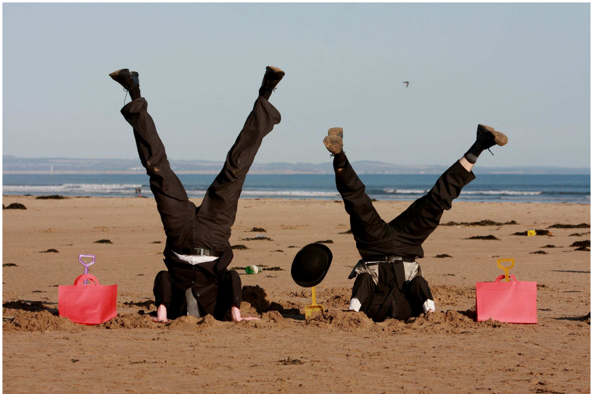
G20 protest in Scotland

Act locally with the World Development Movement