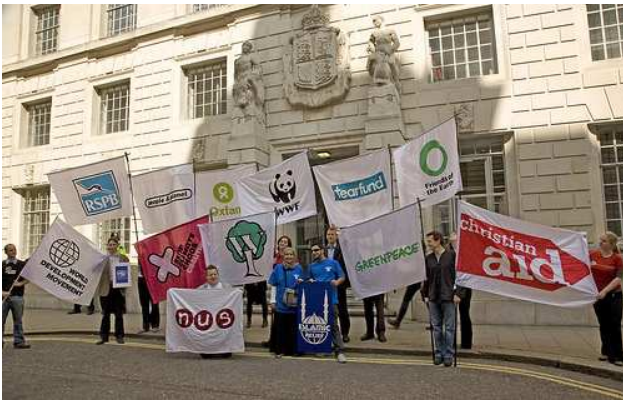
WDM joined a delegation of organisations outside the offices of DECC to hand over 85,000 messages to the minister for energy and climate change, Ed Miliband.

We now have six months before the government's final policy on coal will be decided. To make the UK really show leadership on climate change before the Copenhagen climate negotiations, we have to increase the pressure on Ed Miliband to rule out unabated coal power for good.